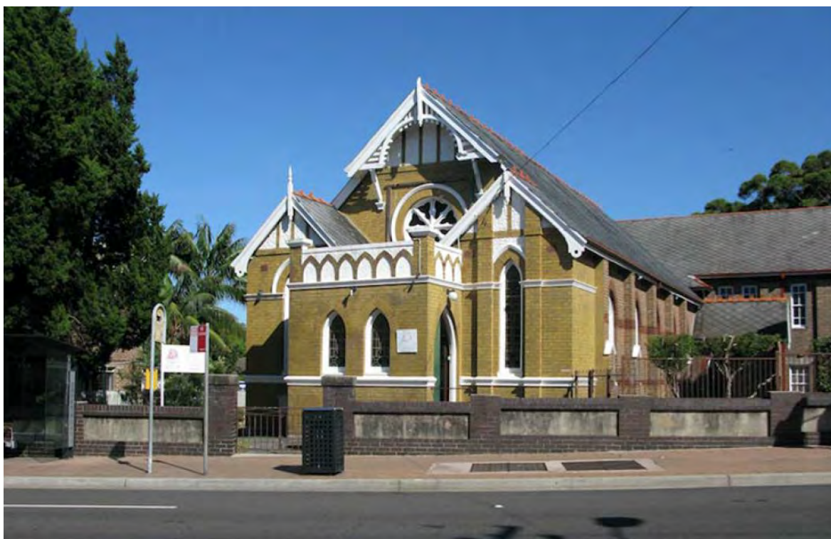
Figure 1: Rose Bay Methodist Church (1904) and the Wesley Hall (1929), (Source: RA Moore February 2018).