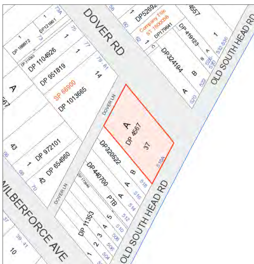
Figure 2: Cadastral map showing the subject site outlined in red