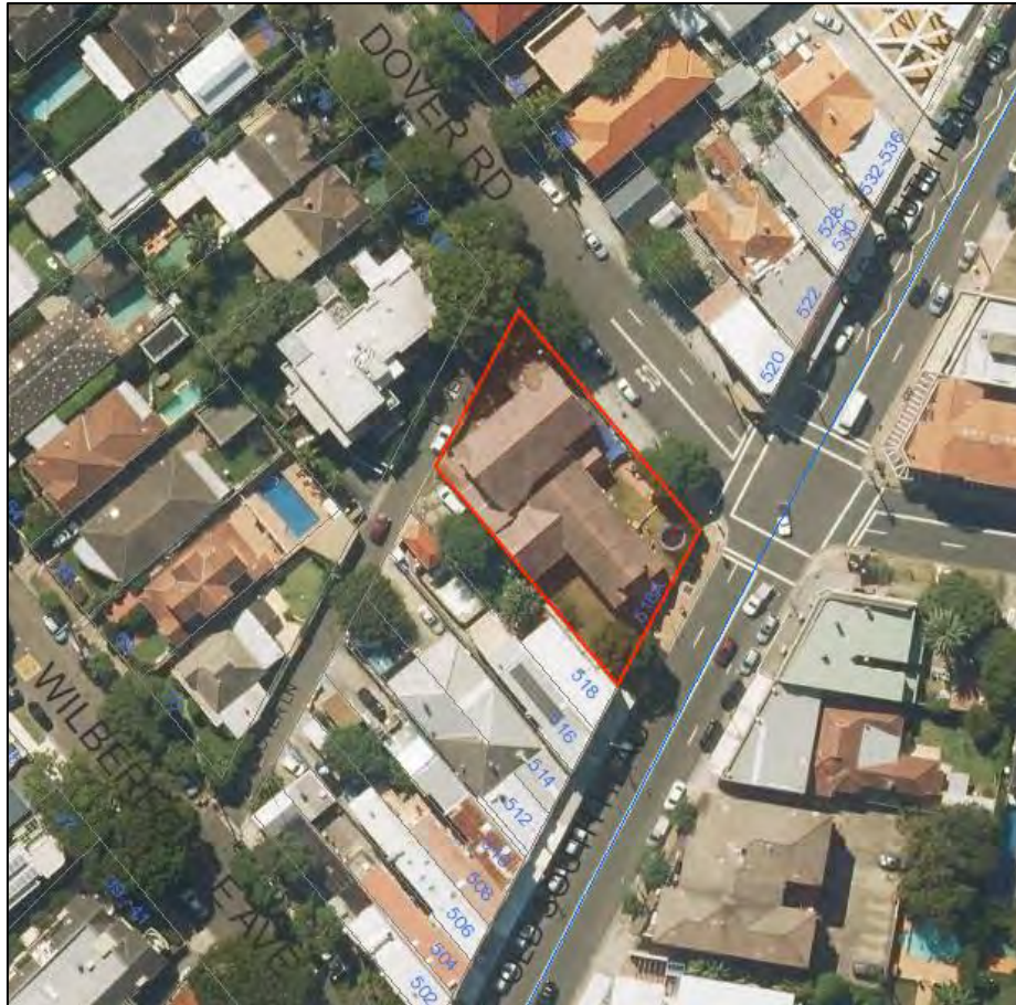
Figure 3: Aerial photograph showing the subject site outlined in red